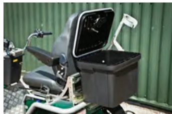
Rear Mounted Storage Box