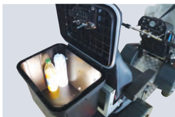
Rear Mounted Storage Box