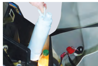
Lockable Bonnet Storage Box