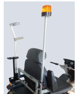
Left: Cane & Crutch Holder Right: Optional Flashing Beacon