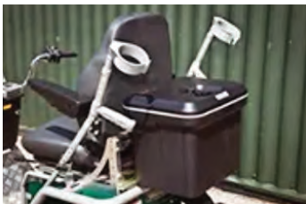
Cane & Crutch Holder