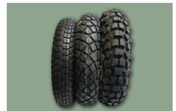
3x Tyre Options

Left: Road/Turf Middle: Off Road (Standard) Right: Aggressive Off Road