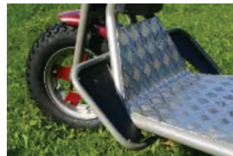
Foot Plate Extensions